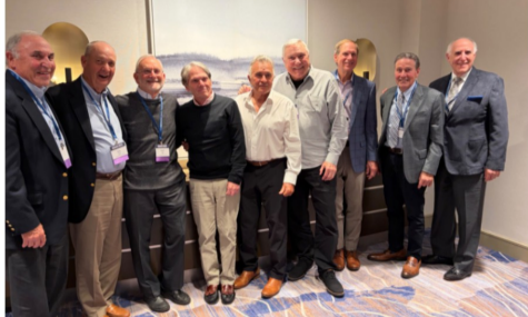
School of Dentistry Class of 1970 Medical & Dental Reunion 2025 Attendees