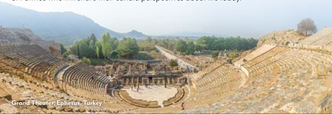
Grand Theater, Ephesus, Turkey

The Roman writer Cicero (106 to 43 B.C.) observed of Athens that “wherever you set your foot, you encounter some memory of the past.” In Greece and Turkey, the stories of antiquity come to life. St. John the Apostle is believed to have penned the Book of Revelation on Patmos; the legend of the lost utopian city of Atlantis lives on in Santorini; and it is on these mythological islands that Odysseus sought redemption in the Underworld and where Orpheus retrieved his first love. Visit the Hellenistic Grand Theater in Ephesus, walk the Sacred Way of Delos and discover ancient Akrotiri—the “Minoan Pompeii.” Enjoy exclusive cultural enrichments, including a folklore performance, a culinary demonstration and the ISLAND LIFE® forum with residents of Patmos who will share their candid perspectives about life today.