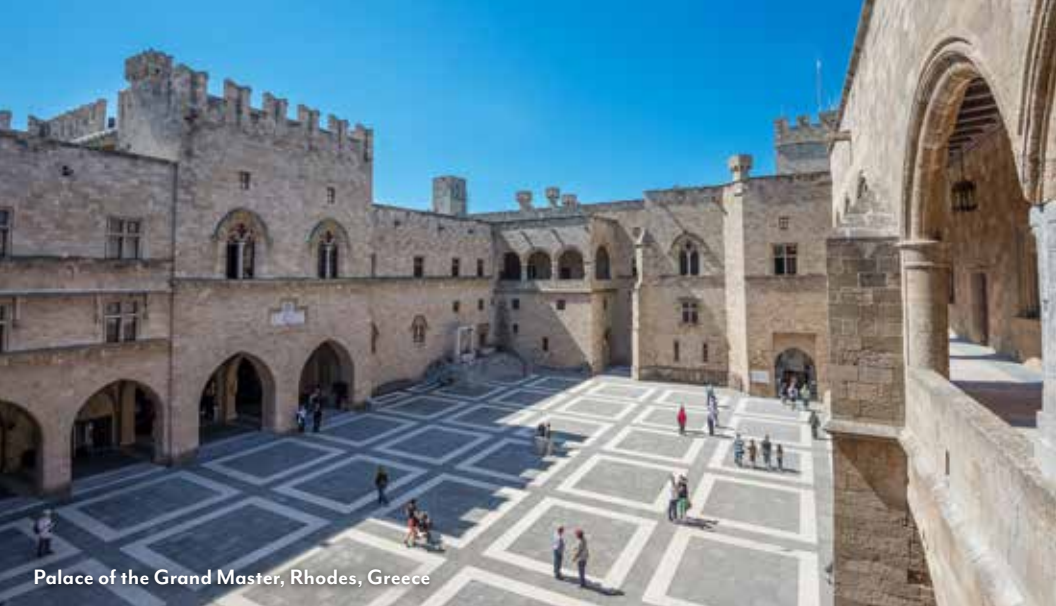
Palace of the Grand Master, Rhodes, Greece