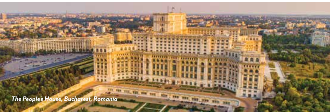
The People's House, Bucharest, Romania

Check out of the hotel and transfer to the airport for a flight back to your home city. (B)