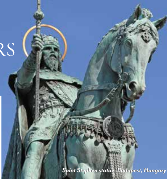
Saint Stephen statue, Budapest, Hungary