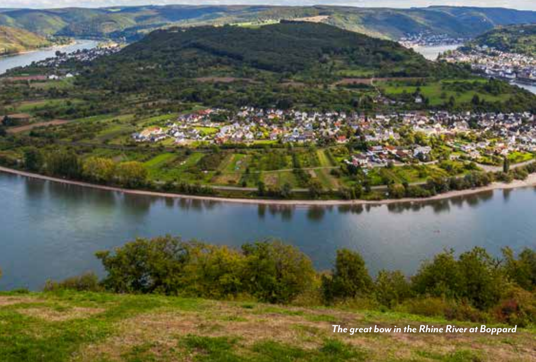
The great bow in the Rhine River at Boppard

Front cover: Reichsburg Castle in Cochem, Germany