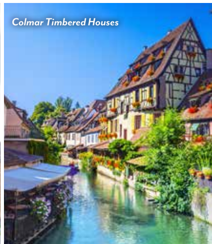
Colmar Timbered Houses