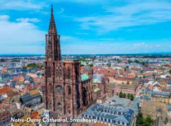
Notre-Dame Cathedral, Strasbourg