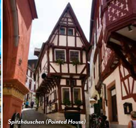
Spitzhäuschen (Pointed House)

and Saar Valley wine vineyards that remained after the Saar Castle above it fell to ruin from the Thirty Years' War. See the town's waterfall in the center of its "Little Venice" and stroll through this picturesque burgh before returning to the ship for dinner onboard. (B,L,D).