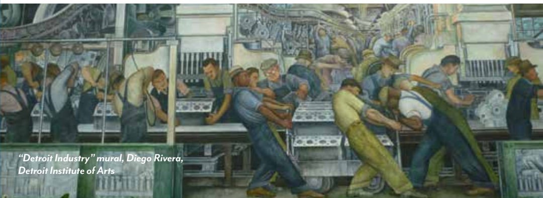
“Detroit Industry” mural, Diego Rivera, Detroit Institute of Arts

Begin today’s adventures at the Detroit Institute of Arts, one of the most significant collections of art in the nation, housed in a magnificent Beaux Arts building. See Diego Rivera’s monumental “Detroit Industry”