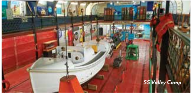
SS Valley Camp

In the heart of North America lies the world's largest reservoir of fresh water, carved by glaciers 10,000 years ago. Surrounded by 11,000 miles of spectacularly sculpted shoreline, the five Great Lakes boast powerful natural wonders, historical maritime landmarks and some of the greatest engineering feats of the 19th century. Our tour offers a glimpse of life on the Great Lakes over the last two centuries as we