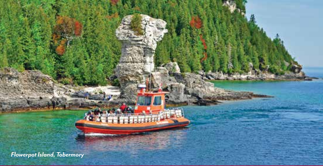
Flowerpot Island, Tobermory

mural, which captures the city's blue-collar history, as well as masterworks by Auguste Rodin, Vincent van Gogh, Michelangelo, Edgar Degas and Paul Cézanne. Then, step into history during a visit to the Edsel and Eleanor Ford House, designed by architect Albert Kahn. Settle in under the stars while cruising Lake Huron tonight. (B,L,D)