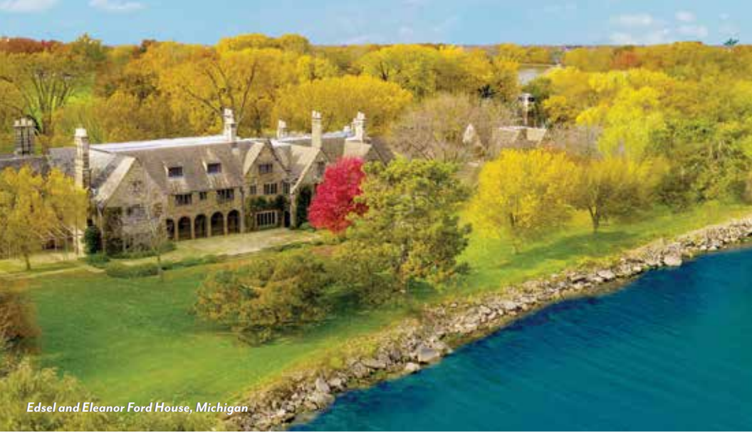
Edsel and Eleanor Ford House, Michigan