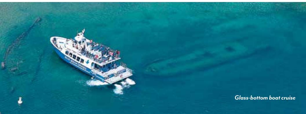
Glass-bottom boat cruise

Following breakfast, disembark and transfer to the airport for your return flight home. (B)