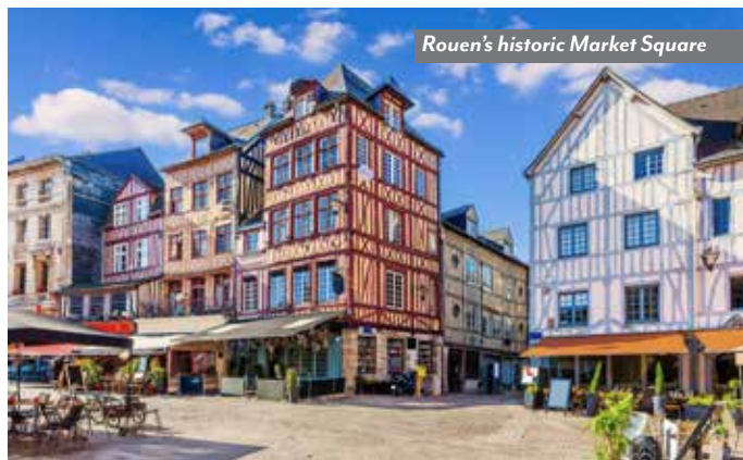
Rouen’s historic Market Square

Attend a lecture on board this evening from historian and