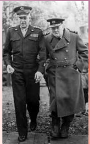
President Dwight D. Eisenhower with Winston Churchill