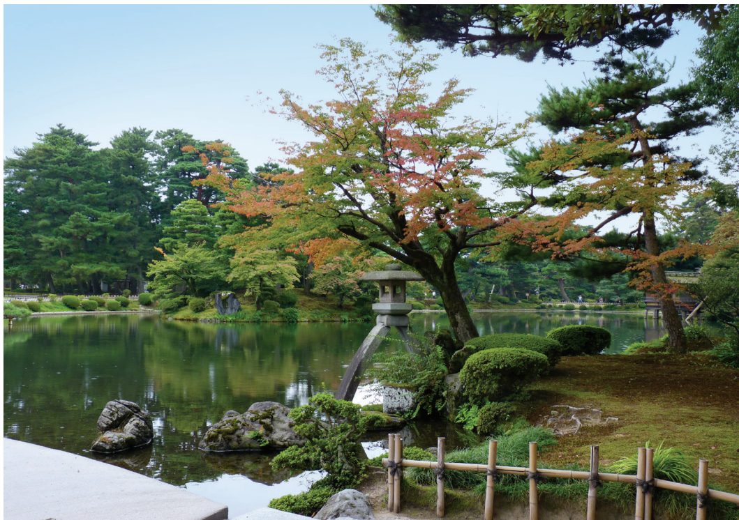
On Day 9 we visit Kenrokuen Garden, one of Japan's finest traditional gardens.

Day 6: Hakone/Takayama Today we travel first by bullet train then by Wide View Hida express train to lovely Takayama in the Japanese Alps, considered one of the country's most attractive towns with its beautifully preserved Old Town. Our explorations center on three narrow streets in the San-machi-suji district where, in feudal times, merchants lived amidst the authentically preserved small inns, teahouses, and sake breweries. This afternoon we attend a traditional Japanese tea ceremony here, an historic ritual of form, grace, and spirituality. B,D