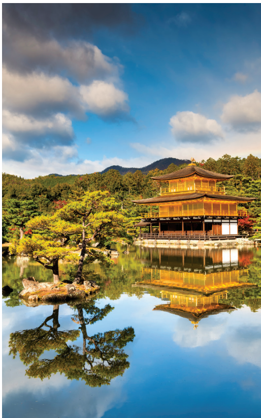
We visit Kyoto’s Temple of the Golden Pavilion on Day 10.