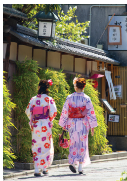
Geishas in traditional dress

Day 11: Kyoto More of Kyoto is on tap today, beginning with a visit to the otherworldly Arashiyama Bamboo Grove; the Kyoto Museum of Traditional Crafts (Fureaikan), showcasing all of Kyoto’s 74 different métiers in one place; and Nijo-jo Castle (c. 1603), the extravagant residence and fortifications of the shoguns who ruled Japan for more than 250 years. Then the remainder of the day is free for independent exploration in this traditional, yet modern city before we gather for dinner together tonight. B,D