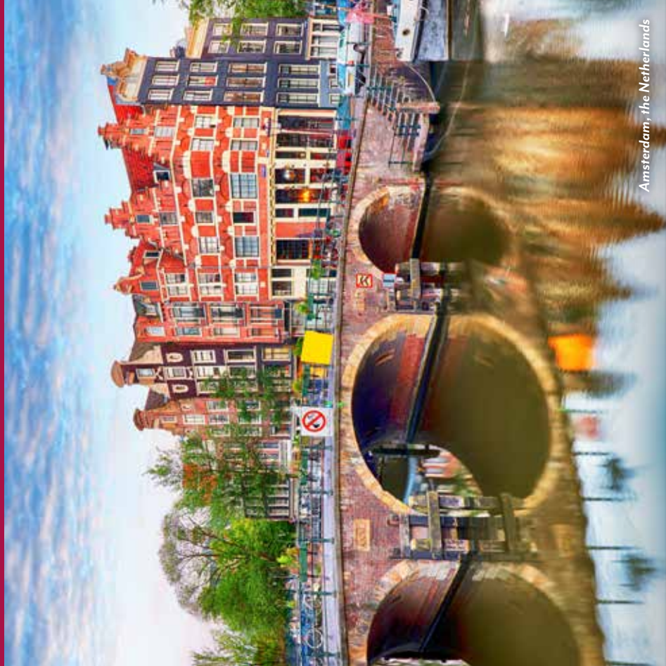
Amsterdam, the Netherlands

Early Booking Savings* available | Save $2,000 per couple!