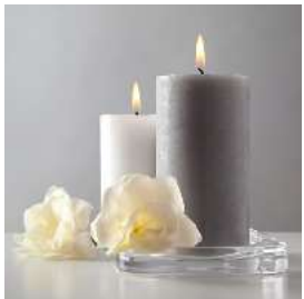
Monica Banks-Damon 4/3/1963 – 4/14/2004