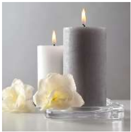
Edwyn Mara 7/24/1960 - 3/14/2011