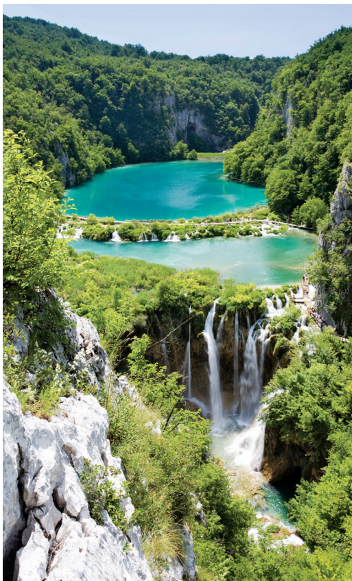
We visit Plitvice Lakes on Day 9.