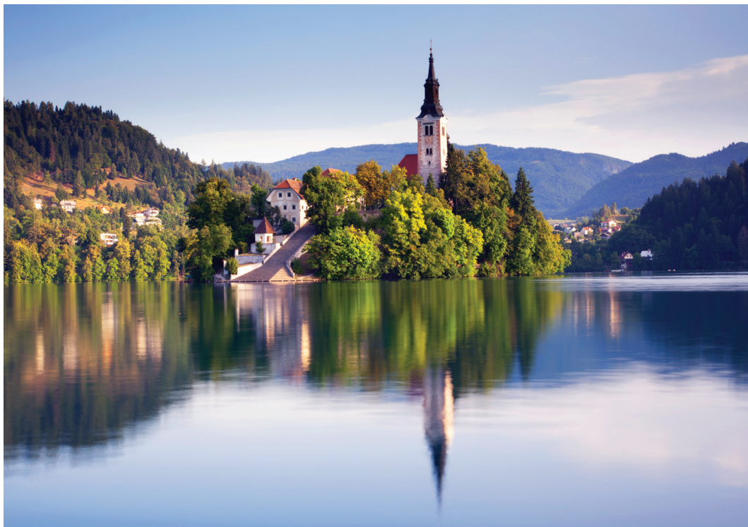
Lovely Lake Bled, surrounded by mountains and forests

Day 7: Opatija/Istrian Peninsula Today's tour of the Istrian Peninsula reveals the multicultural roots of this alluring spit of land jutting into the Adriatic. At various times a vassal of Venice, the first Austro-Hungarian Empire, Fascist Italy, the Yugoslav Federation, and finally, Croatia, Istra, as it is known, boasts an interesting history, mild Mediterranean climate, lovely scenery, and good wines. Our first stop is in the port of Pula, where we visit the well-preserved remains of a Roman amphitheater (c. 177 CE). Next is Rovinj, a charming old Venetian port where we are free to explore on our own and perhaps enjoy lunch at an outdoor café. After returning to Opatija late this afternoon, we dine together tonight at a local restaurant. B,D