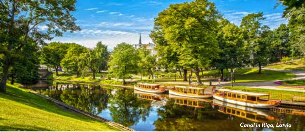
Canal in Riga, Latvia