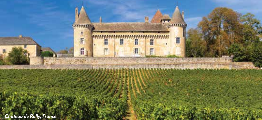
Château de Rully, France

through the hills around Tournon aboard the Train de l'Ardèche. Return to the ship for lunch and a wine and chocolate tasting with a local wine expert. Cruise to Vienne, where you'll begin your tour with a short train ride to the top of Mount Pipet. Appreciate the stunning view of the charming village and river, and then continue on a walking tour. See the medieval Cathédrale Saint-Maurice d'Angers. (B,L,D)