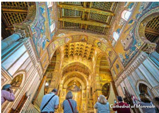
Cathedral of Monreale

of Trapani and continue to Segesta. See the ancient and well-preserved Doric Temple, with 36 gold limestone columns as well as an amphitheater still in use today. Visit the medieval town of Erice, set atop a hill surrounded by a lush park and accessible via cable car.