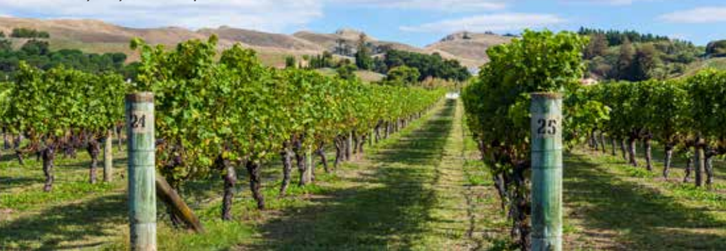
Hawke's Bay vineyard near Napier

Spend your final day in New Zealand in the storied city Christchurch for a tour that showcases the highlights—including the Mona Vale Gardens and the Canterbury Earthquake Memorial. Enjoy lunch before returning to your home city. (B,L)