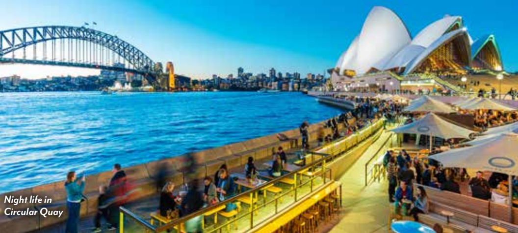
Night life in Circular Quay