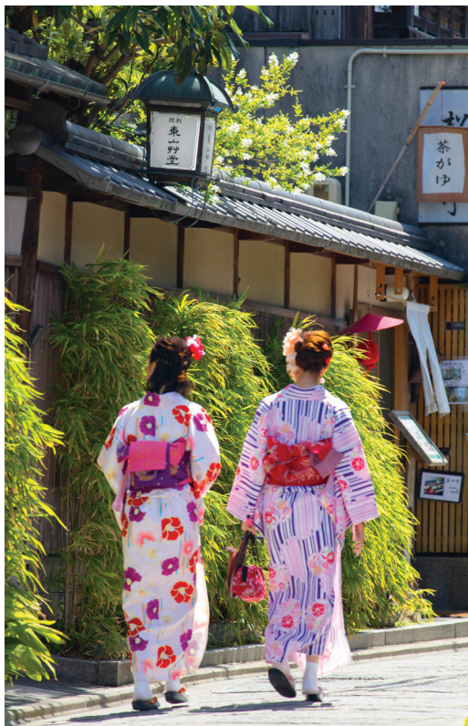
Geishas in traditional dress