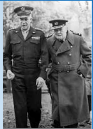
President Dwight D. Eisenhower with Winston Churchill