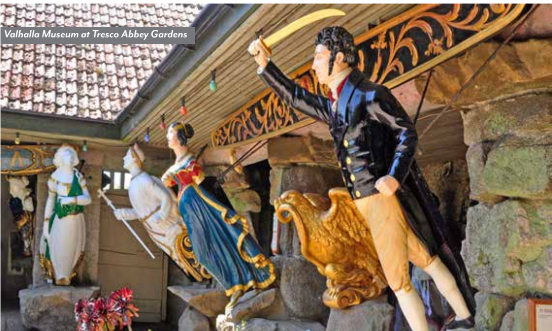
Valhalla Museum at Tresco Abbey Gardens

Following breakfast, disembark and continue on the Post-Program Option or transfer to the airport for your return flight home.