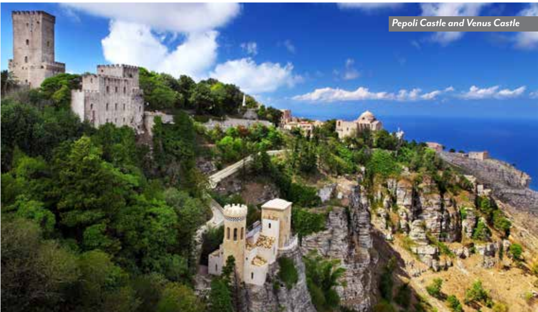
Pepoli Castle and Venus Castle

Transfer to the airport for your return flight home.