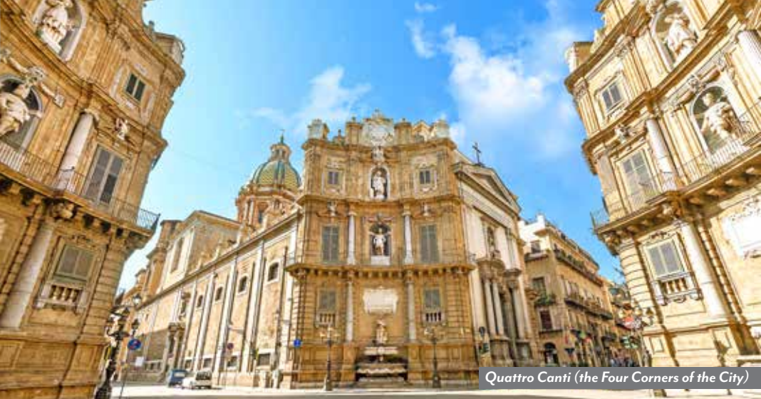
Quattro Canti (the Four Corners of the City)