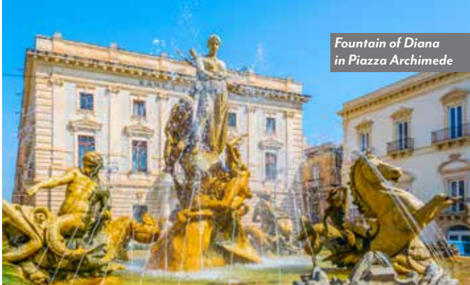
Fountain of Diana in Piazza Archimede