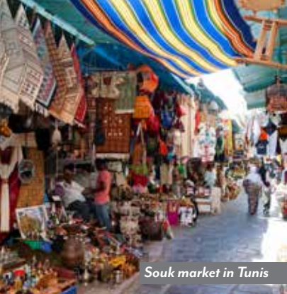
Souk market in Tunis