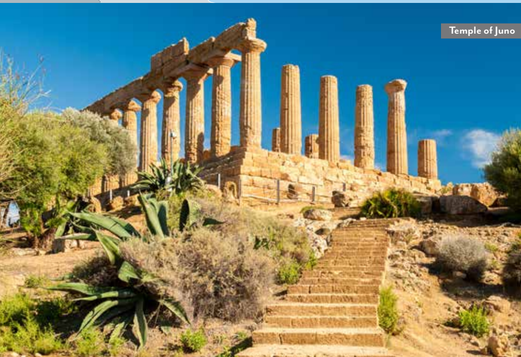
Temple of Juno