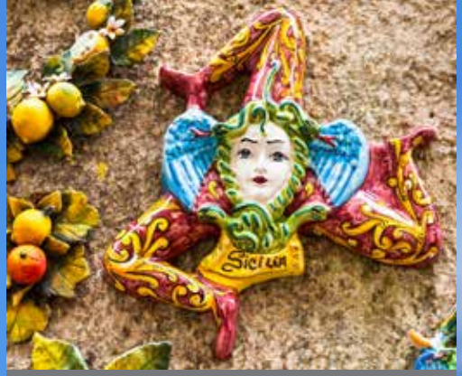
Ceramics showing Trinacria , the symbol of Sicily