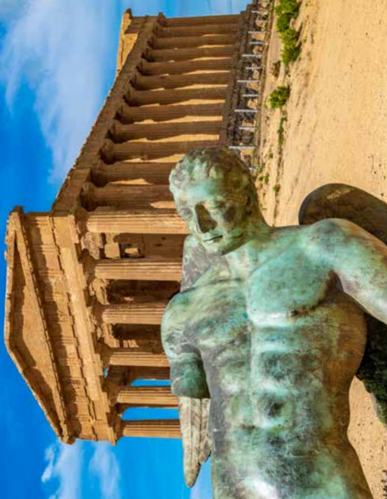
Temple of Concordia and bronze Icarus statue