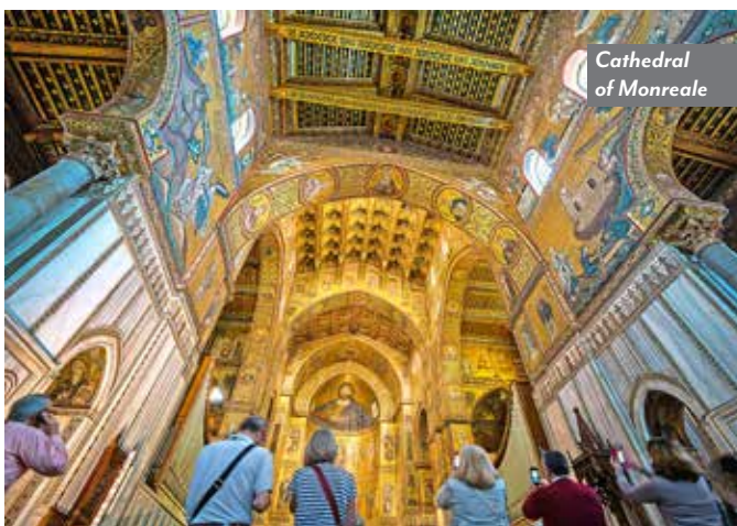
Cathedral of Monreale

Cruise through the Strait of Messina before arriving in Reggio Calabria to visit the National Archaeological