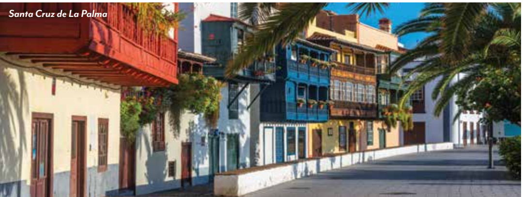
Santa Cruz de La Palma

Travel to the UNESCO World Heritage Site of Teide National Park, a wilderness of mineral-tinted rock, ancient lava flows, and distinctive vegetation not found anywhere else. Gaze across the vast caldera of Las Cañadas (dormant since 1909) to the snowy summit of Mount Teide and enjoy a panoramic view of the Roques de Garcia. After lunch at a local restaurant, visit the UNESCO-designated San Cristóbal de la Laguna, a beautiful university town established in 1496 that boasts rich history and extravagant architectural styles. Walk back in time as you stroll through the Moorish 17 th -century Canarian courtyards. (B,L,D)