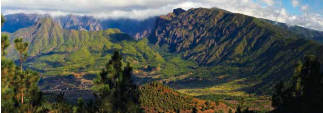
Caldera de Taburiente, Las Palmas

Disembark the ship and fly home or continue your journey with the Post-Program Option in Fez, Morocco. (B)