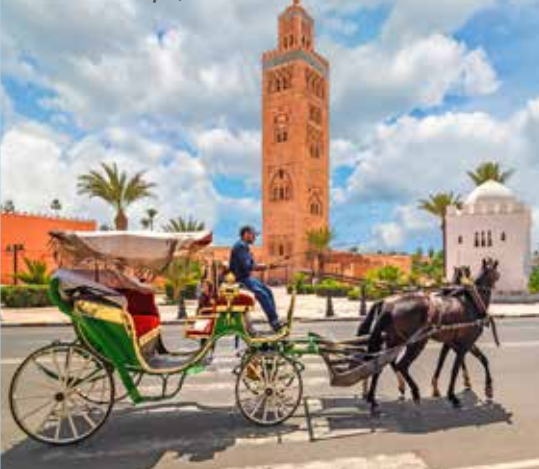
Koutoubia Mosque, Marrakech