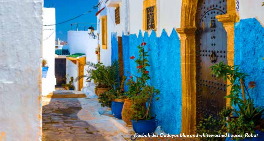
Kasbah des Oudayas blue and whitewashed houses, Rabat